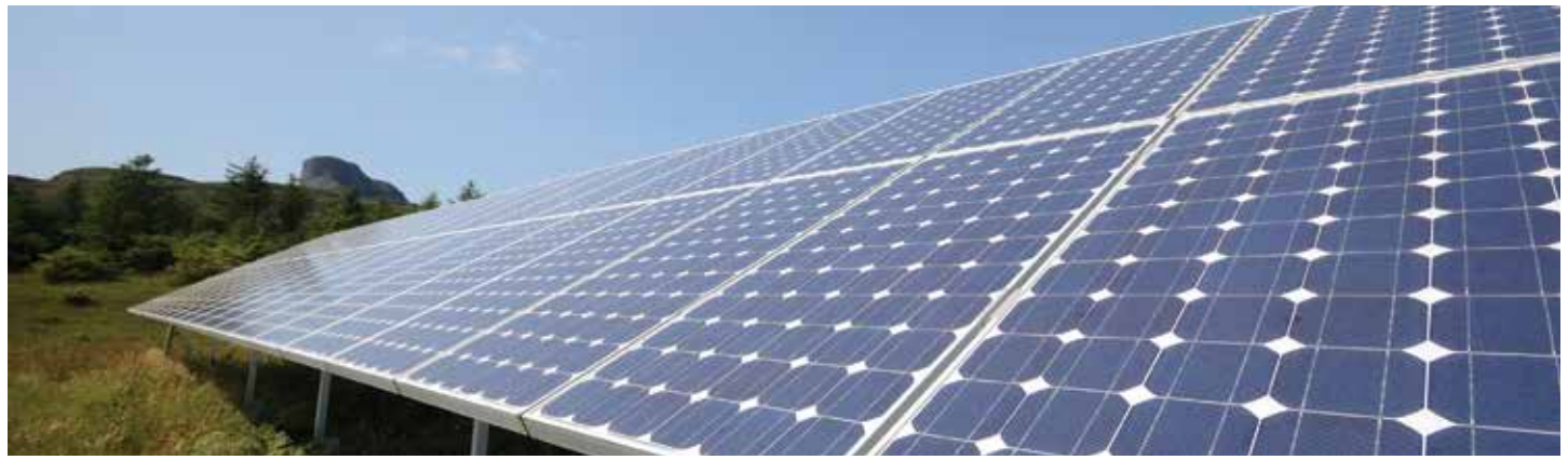
Solar energy, Eigg